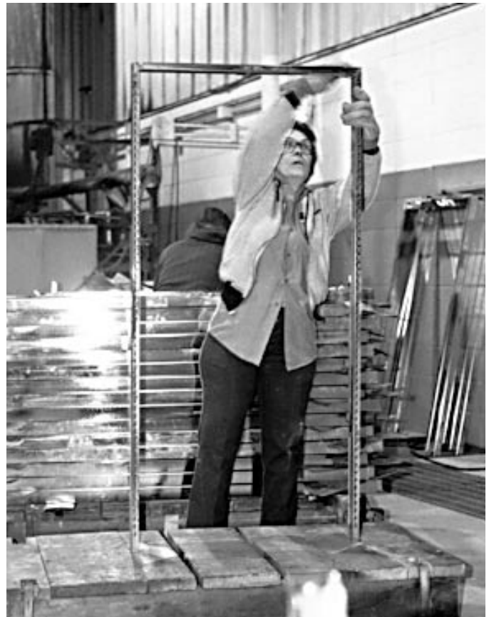
Final inspection is done by an operator wearing gloves to help detect roughness. Better cleaning and improved filtration have reduced roughness and lowered reject rates.