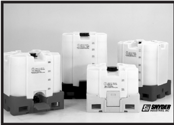
Large Storage Vessels