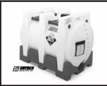
Small Storage Vessels