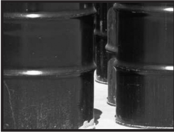
Drums & Barrels