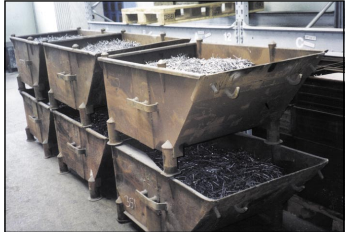
Above: Some of the daily output of wood screws and automatic and single set nails from NKT's automatic plating lines.

Perhaps the most telling fact about this application is the low profile the filtration system has maintained from its installation and especially during the tenure of the new plant manager. It has developed no maintenance troubles and no consumable costs, items that normally attract the attention of anyone responsible for plant operations. NKT's experience proves the TITAN system truly provides unattended, completely automatic filtration.