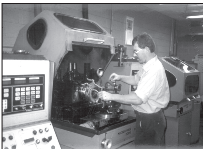
One of Fletcher Machine Company's four EDM machines used in manufacturing woodworking equipment.

Enter the SERFILCO Trans-O-Filter. Fletcher Machine purchased two units. Each Trans-O-Filter uses a one micron filter cartridge that costs less than $20.00, and is changed about every three weeks.