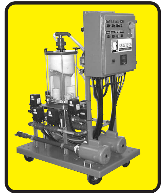
Pilot unit available for rental. Consult Sales Dept.